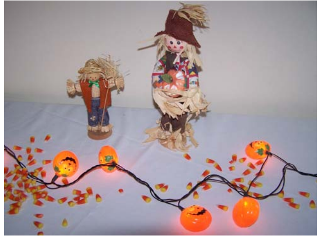
Darling decor of October dinner committee