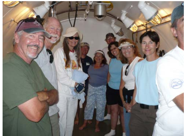
Many of us inside the hyperbaric chamber